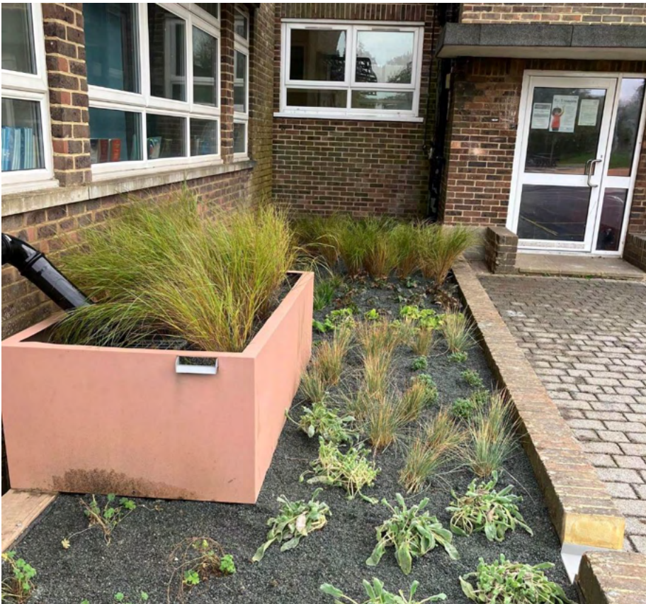
Figure 8: Large rain planter and rain garden

A fourth downpipe flows into a rain planter which overflows to a larger planter/rain garden.