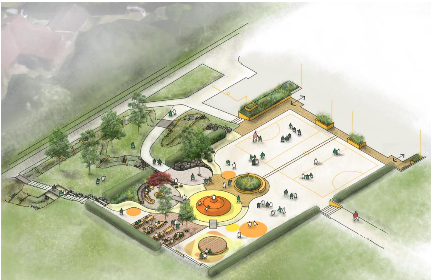
Figure 3: Concept (credit Robert Bray Associates)