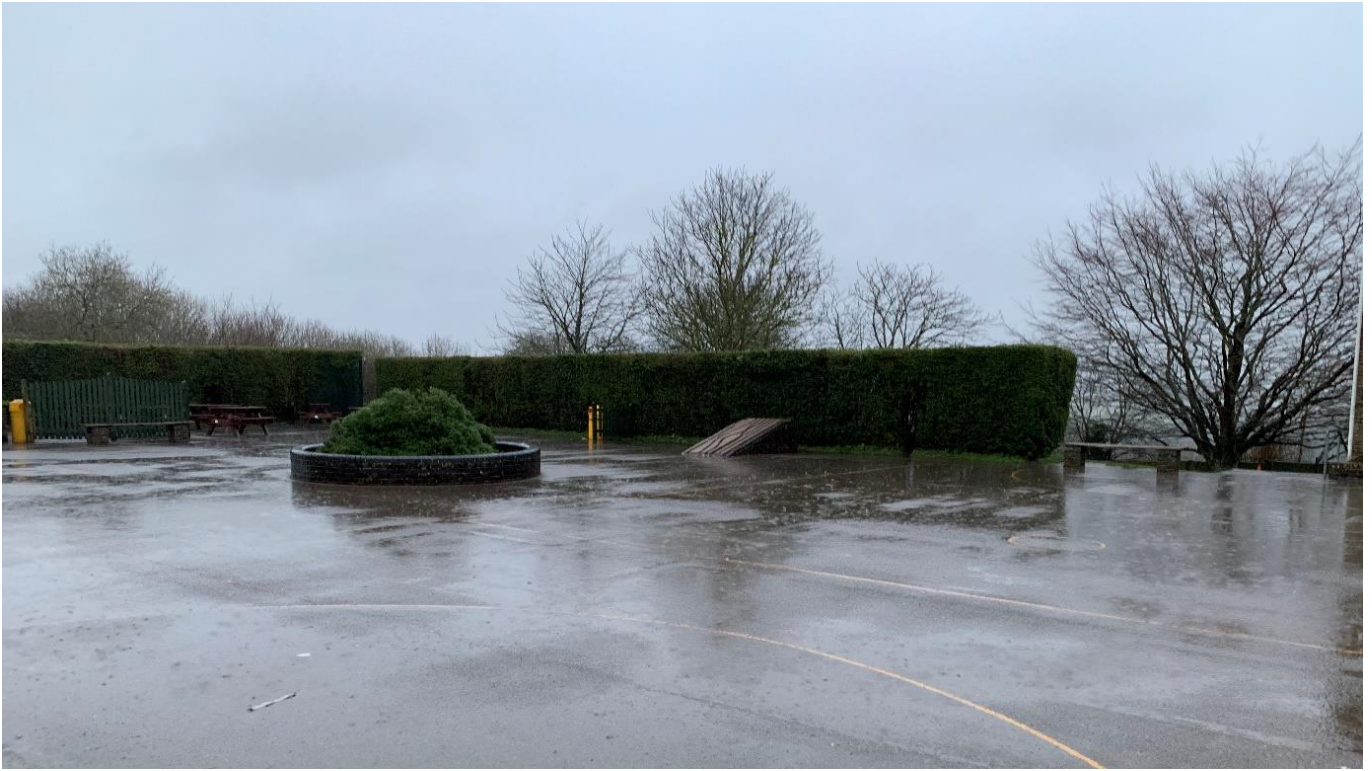
Figure 1: Site pre-construction