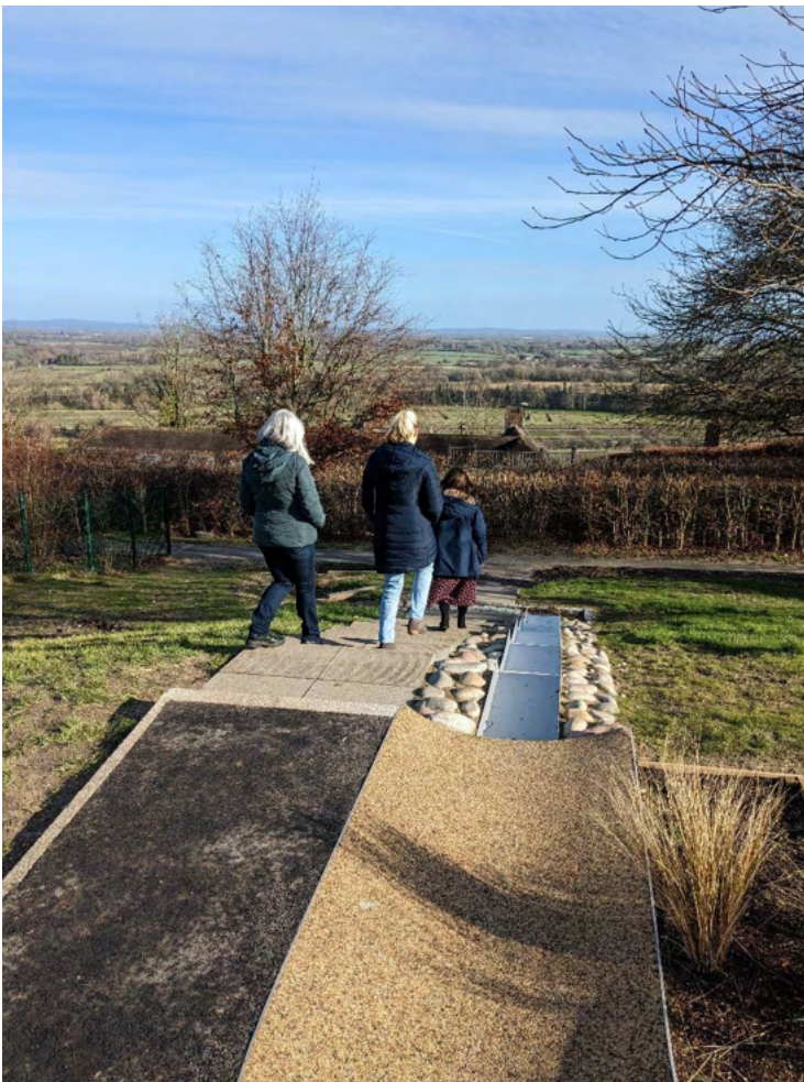
Figure 7: The dry river joins the cascade

Flow continues into meadow basins via grass swales and a cascade.