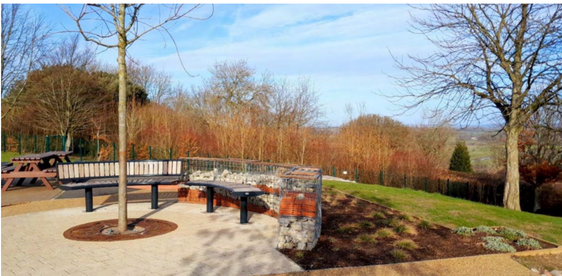
Figure 9: Minibeast hotel gabions

The meadow basins are seeded with locally-sourced wildflower mix. Boulders add extra seating and play features and create micro-habitats as the planting establishes and biodiversity increases. Minibeast hotel gabions have been added which are part filled with stones and tiles with the remaining space to be filled by the children with materials sourced in the school's woodland area.