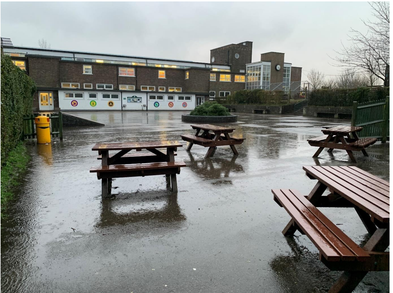
Figure 2: Site pre-construction