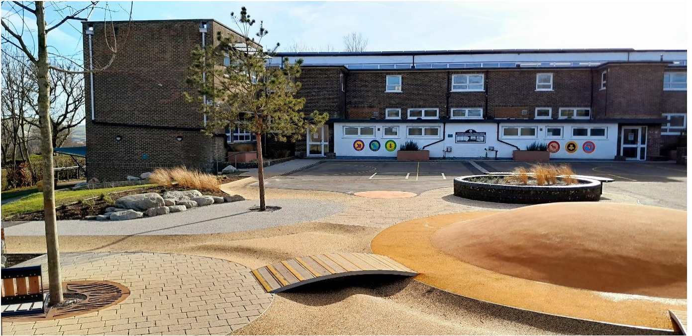
Figure 6: Dry river

From the central planter the rain passes through permeable paving into a 'dry river' meandering through the playground.