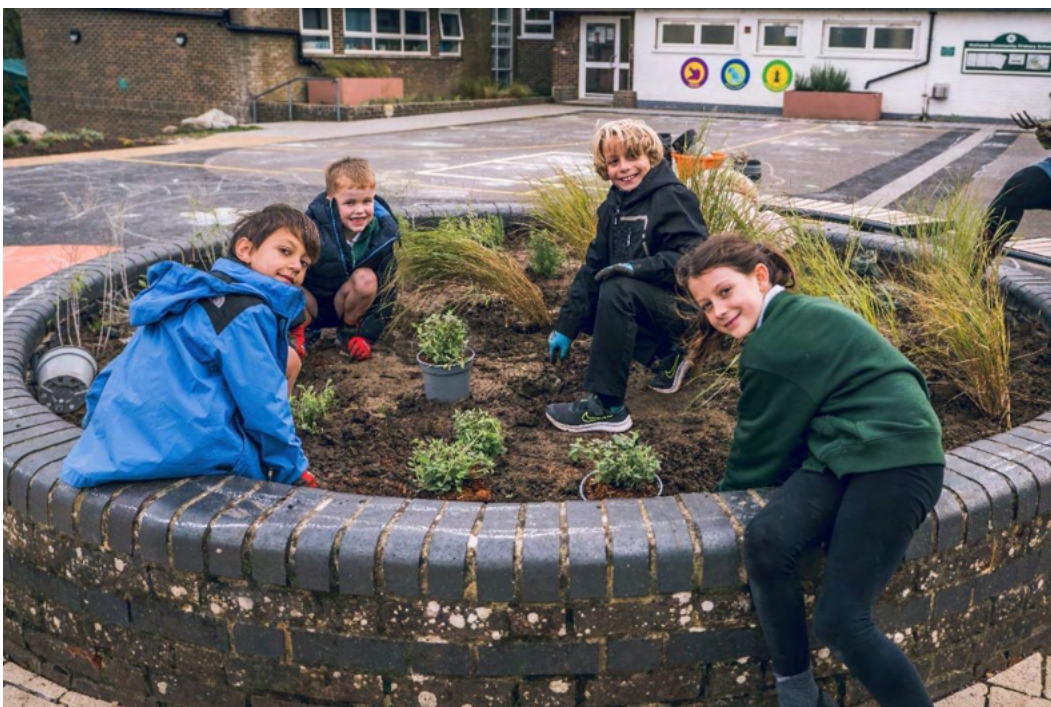
Figure 5: Central rain planter with disconnected downpipes and surface-level channel seen behind

A surface-level channel conveys water through the centre of the sports court to a central rain planter.