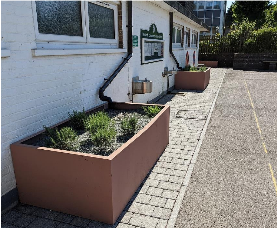
Figure 4: Rain planters

Downpipes draining a large area of roof space were disconnected and directed through a playful rainscape. Three downpipes convey the water into rain planters with letterbox outlets which overspill onto permeable paving.